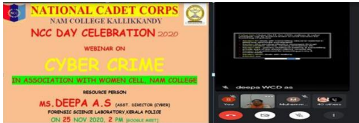
-Webinar screenshots -