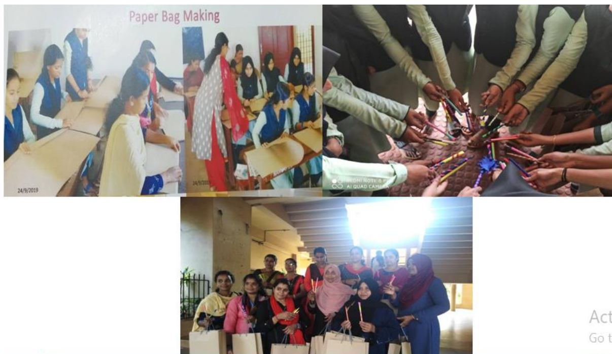
- Paper Bag & Paper Pen making-