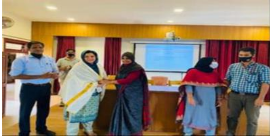
-Honouring the palliative worker-